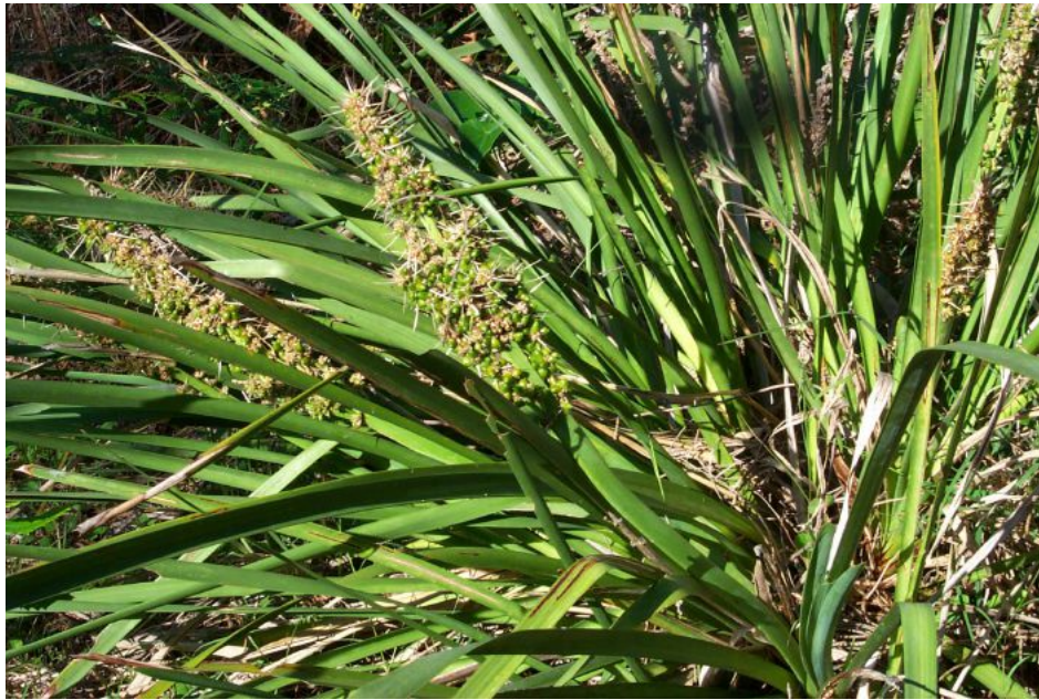
A Spiny-headed Mat-rush ( Lomandra spp) bush full of seed. Once this seed starts to mature it will turn an orange brown colour and can be easily collected by stripping it from the plant in an upward motion with your hand.

Mat-rushes ( Lomandra spp.), referred to by Rod as “bush-rice”, was another favourite group of plants and their gardening was well-attended. The rice-like seed is a staple and is used in making bread and cakes. Seeds from gardens of bush-rice could be carried away for later eating or planting elsewhere. The base of the leaves of mat-rushes are also eaten, while the leaves themselves are good for making strings and baskets.