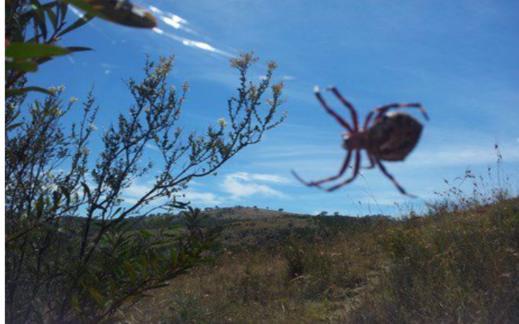
This spider is making use of Country

The Aboriginal view is that Country owns you and that Country teaches you what you need to know. If you can learn from Country - “if Country speaks to you - then you belong to Country”