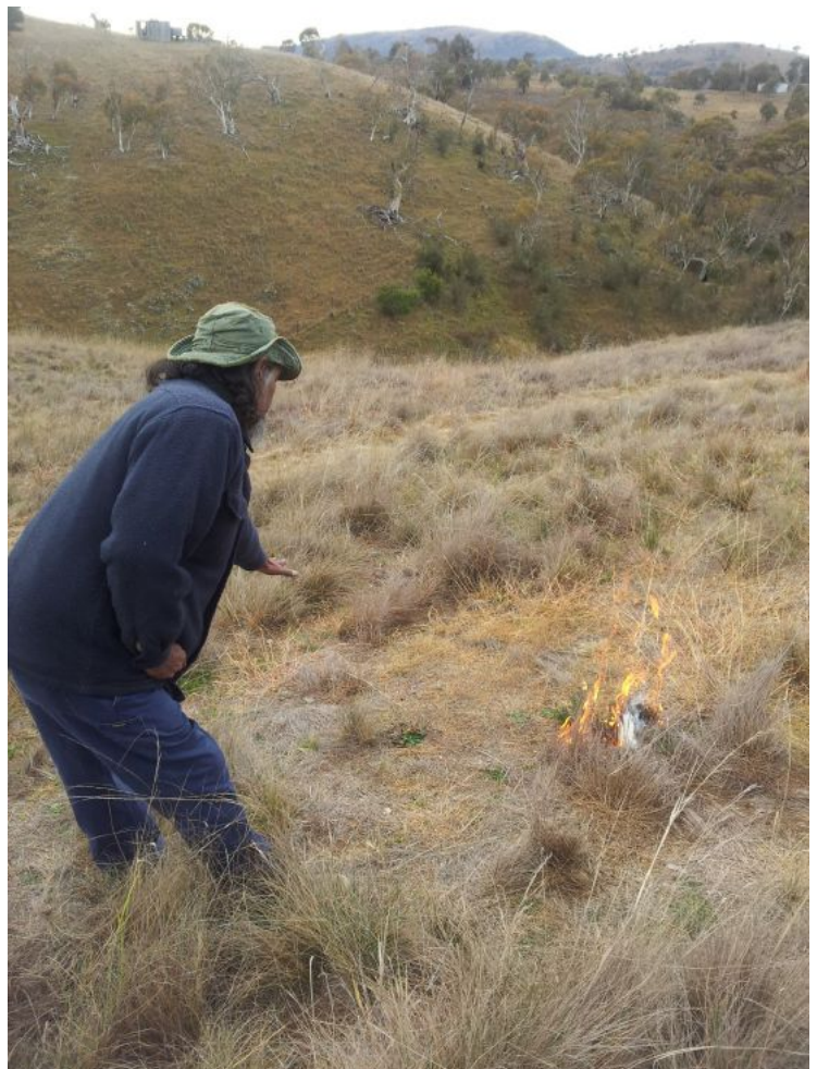
Rod conducting an MLC Project burn in native grassland in 2013