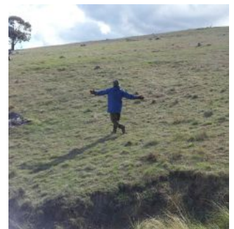
Rod steps out to indicate where to establish the wick

Rod articulates the importance of 'wicks' to transport nutrients up-hill and believes that wicks should be left unbroken, or if broken, they should be recreated. Rod points to vegetation standing isolated without a wick to support it as being in poor health. It is important to note that the current scientific validity of the functionality of a wick has not been tested.