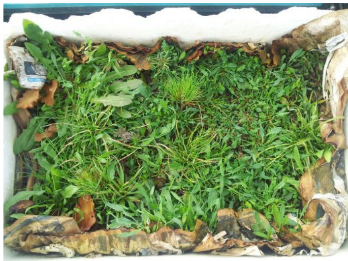
The box of soil collected from under a healthy wattle forest has grown a number of native species. It has also produced some weeds.

While many native plants grew in this sample soil box, for example Burgan ( Kunzea ericoides ), a sedge ( Carex sp.), Small St John's Wort ( Hypericum gramineum ), a woodrush ( Luzula sp.), Common Bog-sedge ( Schoenus apogon ), a rush ( Juncus sp.), and other, there was also a large density of exotic weeds, mostly Sheep's Sorrel ( Acetosella vulgaris ) amongst others. It was decided that this soil not be placed onto a new site due to the threat of introducing weeds to the site. So, unless a perfectly weed-free soil can be guaranteed, this method cannot be recommended.