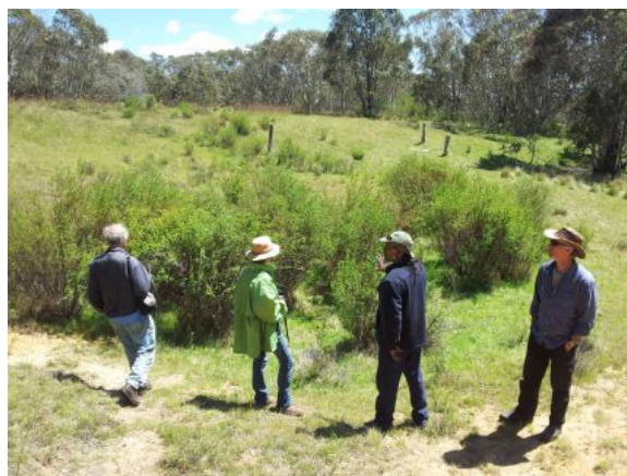
A Snowy Mountain Plum ( Pimelea pauciflora ) orchard due to receive a fringe-burn to enhance its fruiting potential.

Rod, says that high numbers of this plant forms a patch of Culturally Sensitive Vegetation (see page 19). The berries are extremely sweet and provide energy. This species is referred to by Rod as an untapped super-food.