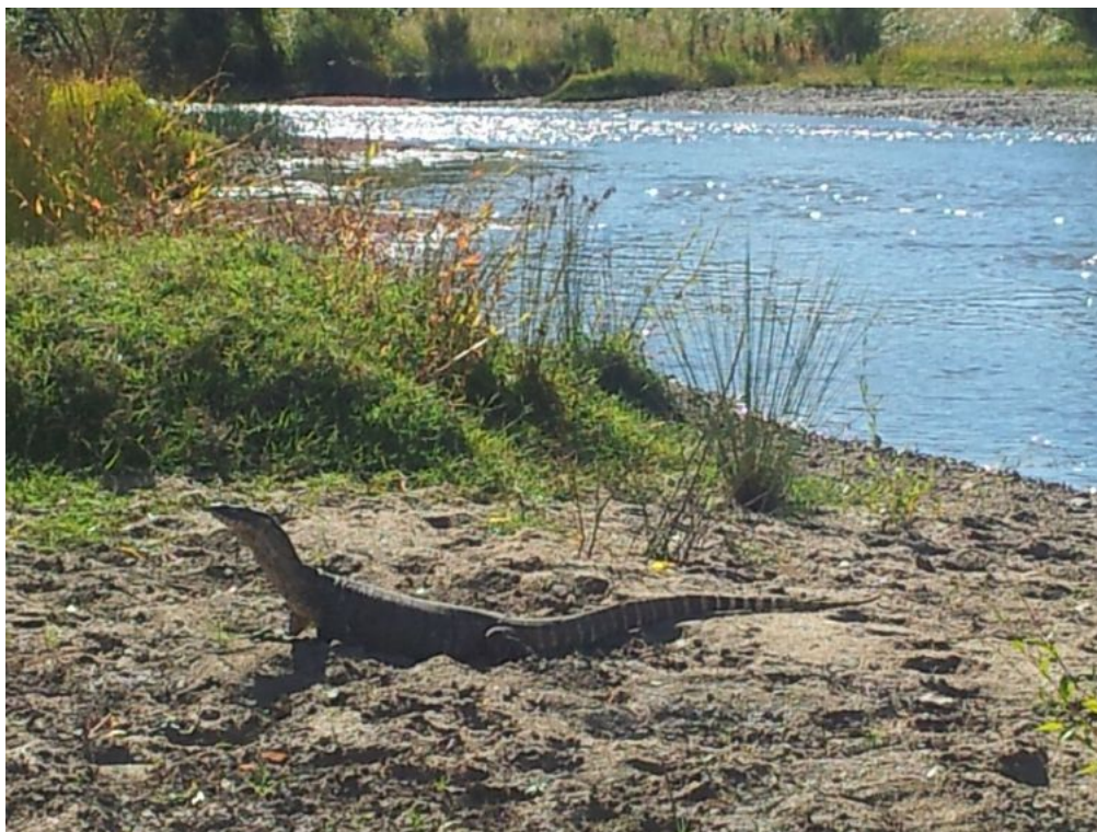
Rosenberg's Monitor, a threatened species, that was spotted on its way back, having taken a drink down at the Murrumbidgee River, Bredbo

Native bees are said to be key players and differ greatly from the European Honey Bee ( Apis mellifera ) as they have mouthparts that are better adapted to the native flowers and are the only way some plants can pollinate.