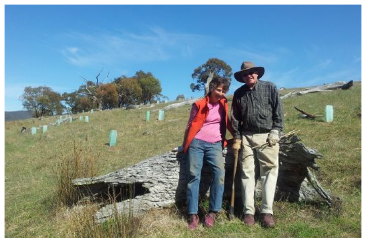
Gundhwar property land-holders are keen to closely monitor the wick.

The site for this trial is across a 10 m x 60 m area on a property named Gundhwar at Michelago. The wick was established in September 2013 by planting Spiny-headed Mat-rush and Silver Wattle plants in a patch from a gully up an adjacent hill to an existing, though isolated, patch of woody vegetation.