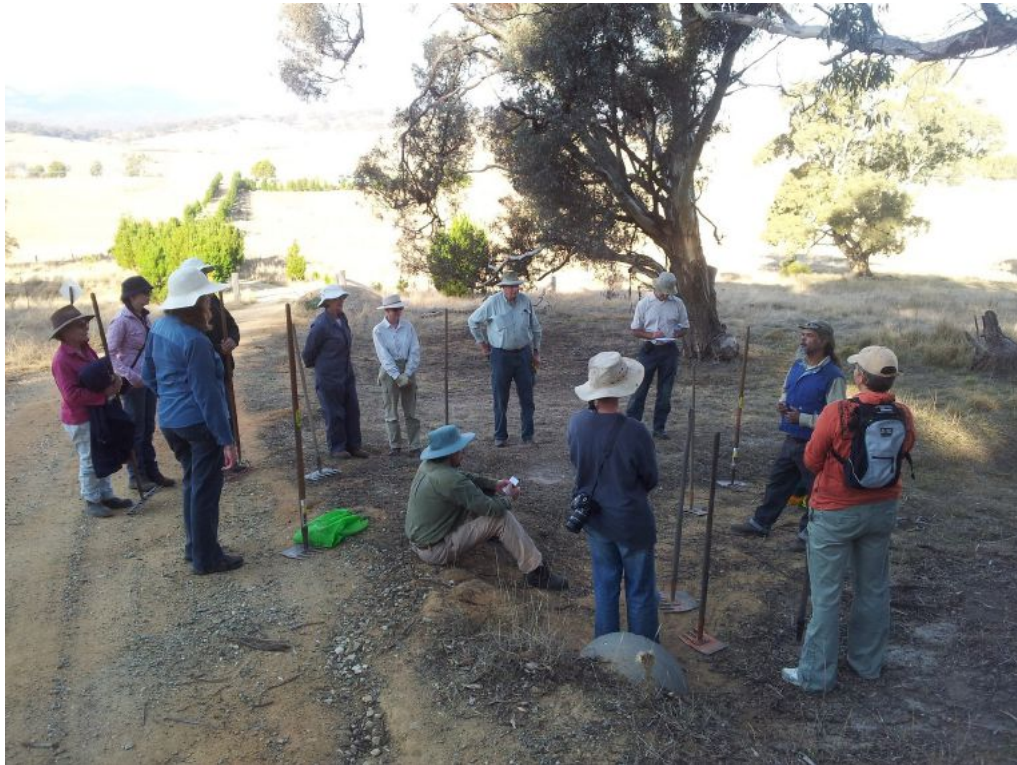
Land-holders soaking up Rod's knowledge at a June MLC Project workshop prior to a cool patch burn on a property in Michelago.

In a response to a first draft of this booklet, Bill Gammage pointed out that our task may be different now. In 1788, Aboriginal people maintained a landscape already well laid-out, but we have first to restore it. In particular localities, there may be little difference between 1788 and now, but not everywhere. Sometimes much preparation may be necessary before reintroduction of traditional Indigenous practices. With a forested area, traditional Indigenous practices might be reintroduced after a wildfire or a controlled burn. Then, new forest paths can be maintained and refuges burnt as the forest re-grows. These areas may be maintained with trickle fires at the appropriate times to re-establish what Rod refers to as old burning patterns. These patterns become established and managed fires will follow them in successive years.