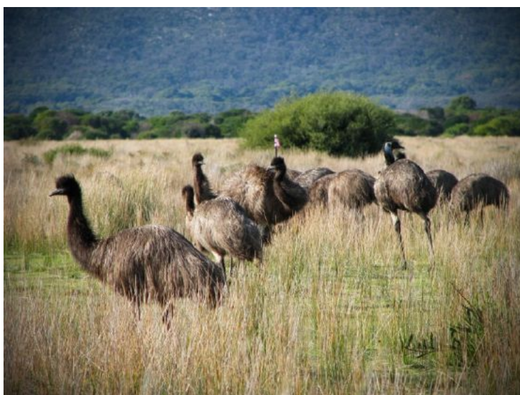
Emus digest hard seeds which are later more easily germinated. They act as “bush policemen” in the landscape

Re-introductions of Emus and other previously present fauna species are being trialled by other projects in the region. For example, several small mammal and bird species have been introduced at the Mulligans Flat Sanctuary in the ACT in a project undertaken by the ACT Government and its research partners. Such projects should only be undertaken by reference to strict scientific guidelines and after going through the appropriate legislative steps. Reintroductions of sensitive fauna species should only be done in areas that are free from the predators that are likely responsible for their initial demise in the region.