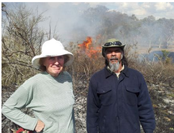
A Carwoola landholder and Rod after the burn

The site for this trial was across an area of 50 m x 50 m on a property at Carwoola, where senescing tea-tree thickets had spread into a patch of Snow Gum Woodland. Prior to the September 2012 burn a 50 m monitoring transect was established and a comprehensive species list was collected as a baseline for future research.