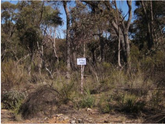
Figure 2. Example of a monitoring photograph with sighter peg