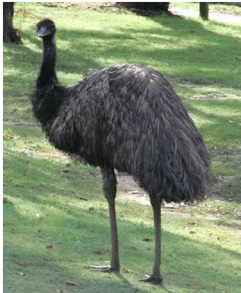
Emu, the bush policeman